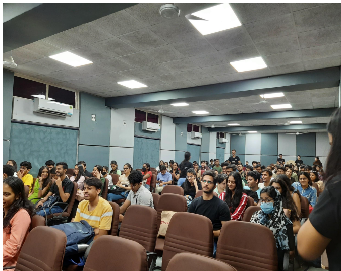
Students attending the session